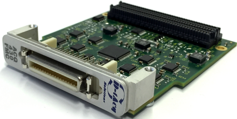
Figure 2: ACQ430FMC Board Appearance

The picture below shows the ACQ430FMC board with the 36 way MDR (Mini-Centronics) Connector